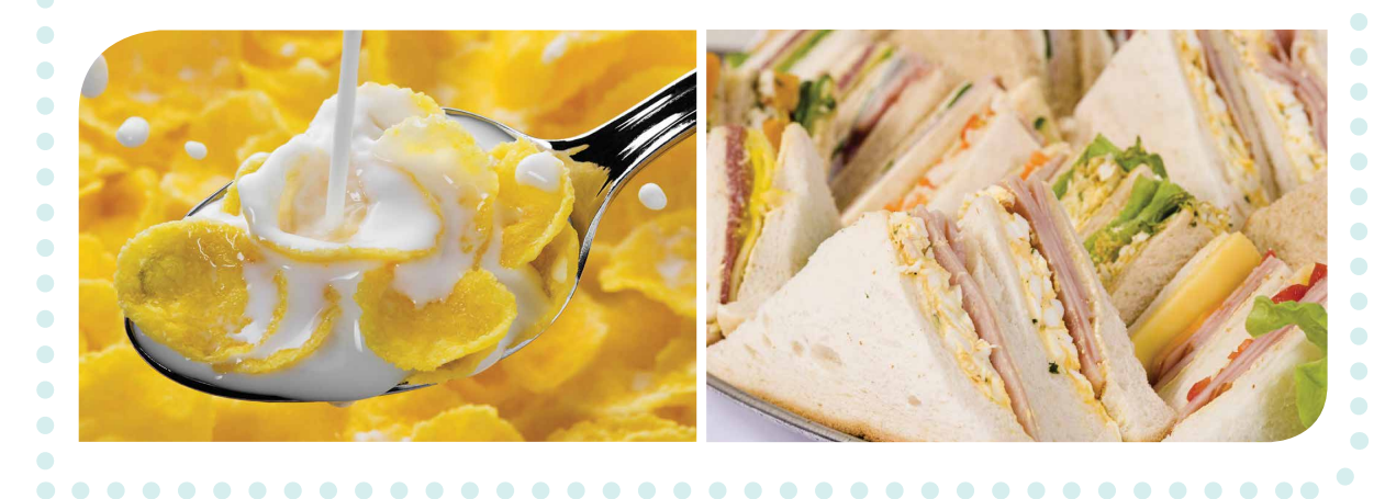
Eating Well A Nutrition Resource for Older People and their Carers

\bullet \bullet \bullet \bullet \bullet \bullet \bullet \bullet \bullet \bullet \bullet \bullet \bullet \bullet