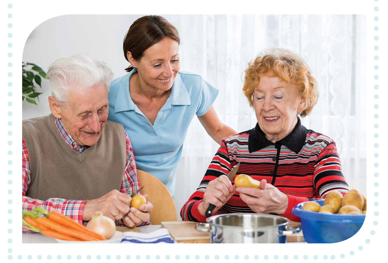
Eating Well A Nutrition Resource for Older People and their Carers

It is very important to seek advice from professionals such as an occupational therapist or a specialist dementia nurse.