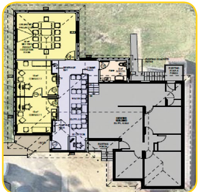
Proposed new site plan for Nunyara Aboriginal Health

Nunyara Aboriginal Health has been busy working around the renovations happening to our office in Ward St Gosford. Demolition and construction work started in early October. The new build will bring two new clinic rooms and a group/meeting room that will house services for the Aboriginal Community. Yerin will provide Outreach GP clinics and other associated services at the new clinic rooms in Gosford. More information will be distributed in early 2017 as to what services will be provided within the new space. Very exciting times!