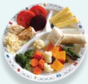
This photograph indicates texture and variety, not quantity.

For more information about giving finger foods, talk to a Child and Family Health Nurse.